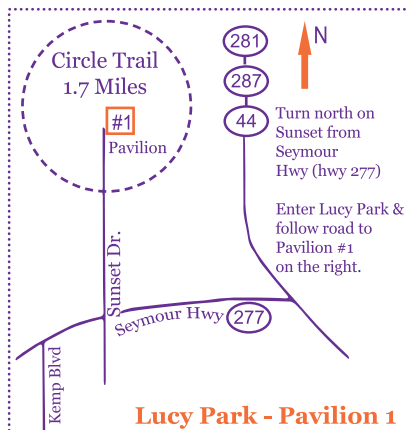
Lucy Park - Pavilion 1

Lucy Park - Pavilion 1 Entrance-5th and Sunset Wichita Falls, TX 76301